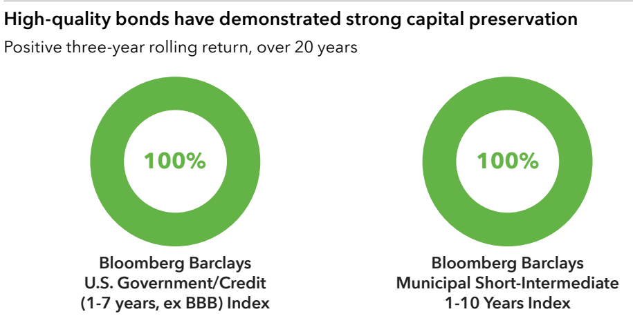
Over 20 years through 12/31/2017.

Bonds issued or guaranteed by stable governments or corporations with good business models and solid balance sheets are key building blocks for a capital preservation strategy. Bonds structured to be backed by strong collateral can also achieve very high quality. Many of these securities have credit ratings at the upper end of the investment-grade spectrum. That said, ratings are only one of many metrics we use to establish the capital preservation aspect of securities. The more risk-averse an investor, the larger the capital preservation component of their portfolio is likely to be.