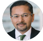
Chit Purani 2004